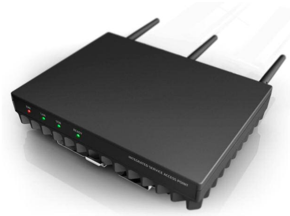
Integrated Service Access Point (ISAP)